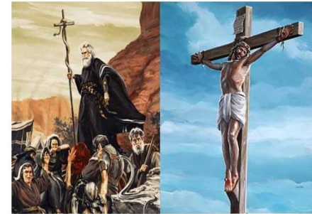
Jesus Lifted UP, as the Object of Healing for the World