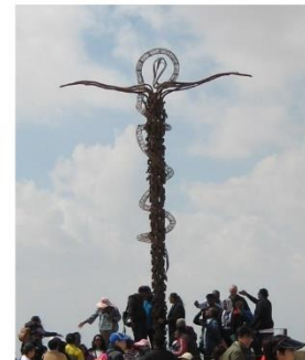
Bronze Sculpture at the Shrine to Moses – Mt. Nebo