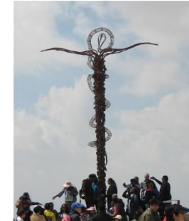
When I survey the wondrous cross...

For Karen and Yancey : Sing vv. 1 & 2 of the hymn, then blank screen and Karen play through once for reflection / meditation, then, Yancey , words for v. 4 and all sing to the end.