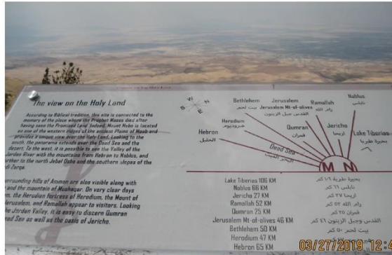
Moses' View of the Promised Land from Mt. Nebo