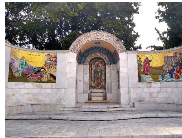
Monument to Paul's Ministry, Berea